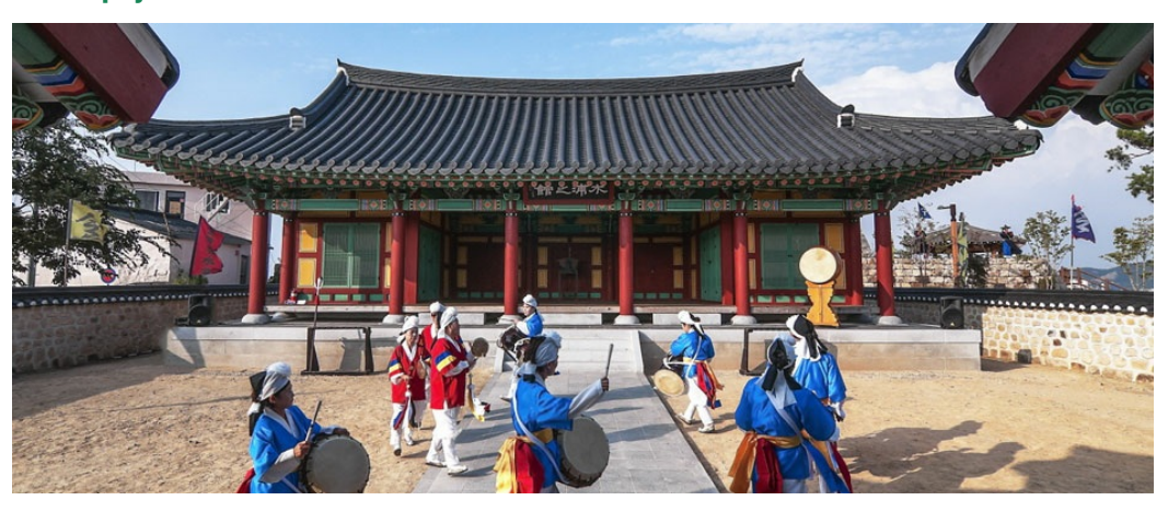
Mokpojin Fort was a naval forces camp during the Joseon Dynasy and it is also called Manhojin Fort (http://www.mokpo.go.kr)