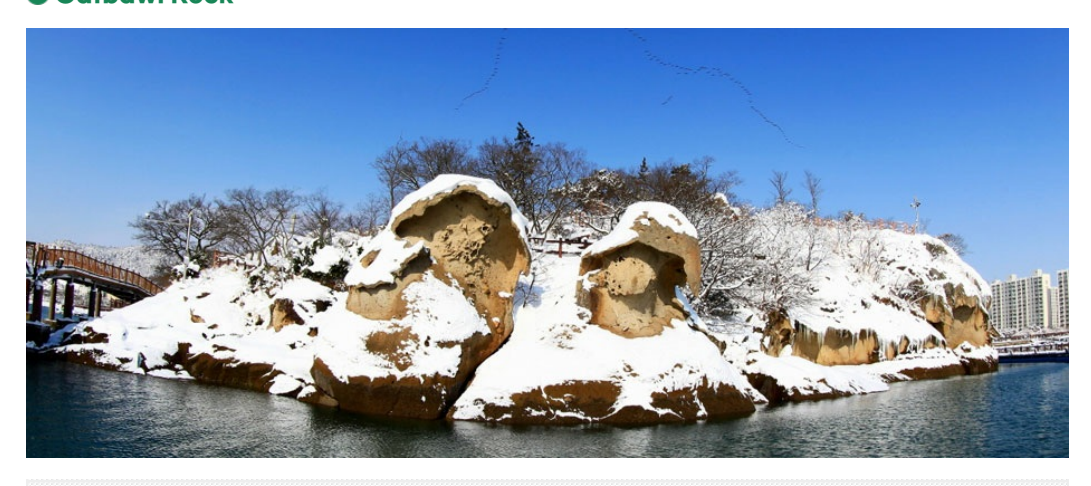
Gatbawi Rock, which is designated as national monument No. 500, resembles two people wearing satgats (Korean traditional hat). It is welded tuff formed by volcanic ash from approximately 80 million years ago. The only way previously to enjoy the view of Gatbawi Rock was to ride on a ship but a pedestrian bridge has been built over the sea, which allows you to observe Gatbawi Rock directly over (http://www.mokpo.go.kr)