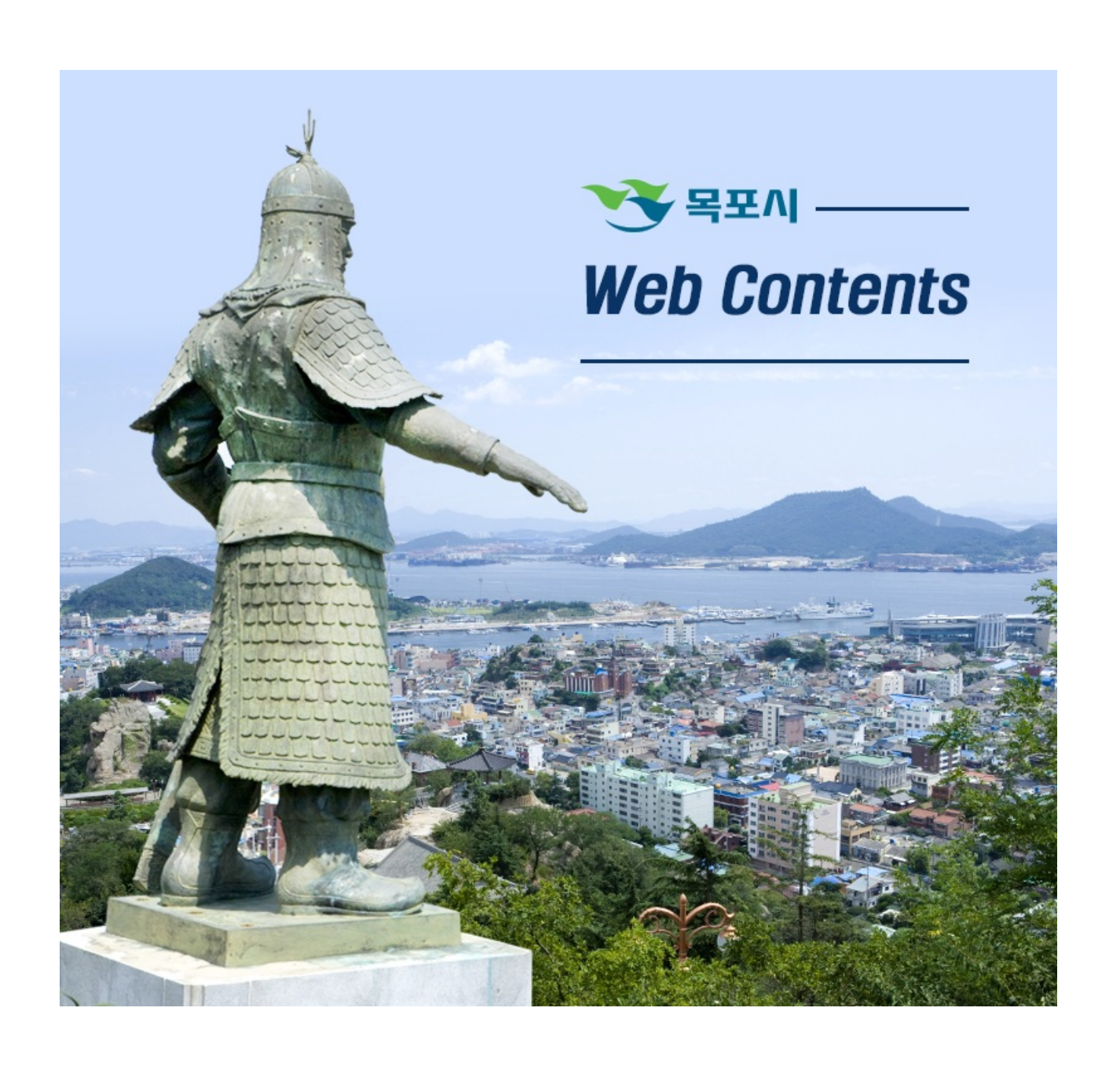
2024년 05월 06일 23시 59분